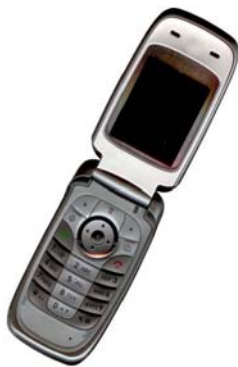
Fig. 3 Example of an image with acceptable resolution