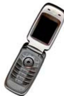
Fig. 2 Example of an unacceptable low-resolution image

Figures must be numbered using Arabic numerals. Figure captions must be in 11 pt Regular font. Captions of a single line (e.g. Fig. 2) must be centered whereas multi-line captions must be justified (e.g. Fig. 1). Captions with figure numbers must be placed after their associated figures, as shown in Fig. 1.